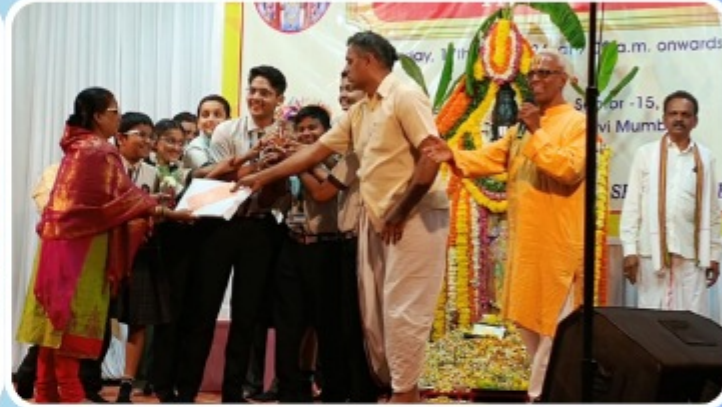
Secondary Students secured the 3rd place in the Shree Vishnu Sahastranama bhajan competition