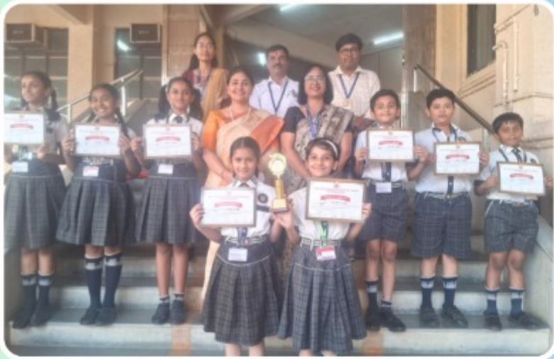
Primary Students secured the 2nd place in the Shree Vishnu Sahastranama bhajan competition