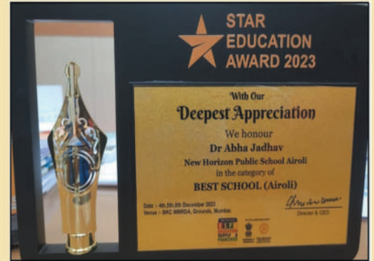
Star Education Best School Award 2023