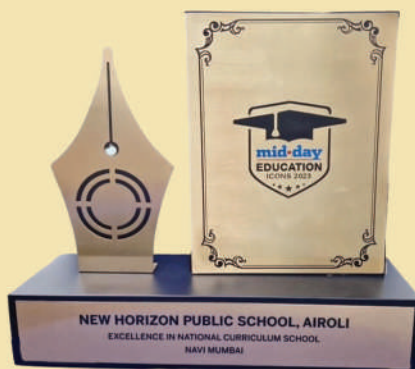
Mid-day Education Icons 2023 Excellence in National Curriculum School