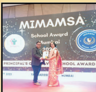
Topmost school of Mumbai and Navi Mumbai. 2023