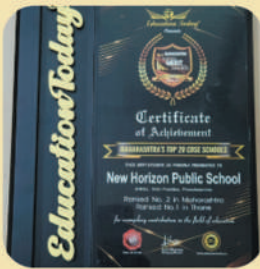
Certificate - Ranked No 2 in Maharashtra and Ranked No 1 in Thane