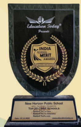
India's School Merit Awards- Top 20 CBSE Schools across India in 2022