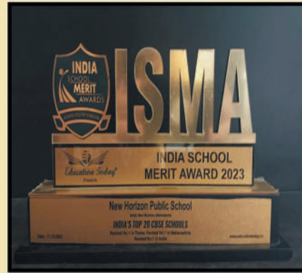
India School Merit Awards 2023-2024 1 st in Thane | 2 nd in Maharashtra | 7 th in in Over all India