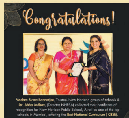
Best National Curriculum Award 2023