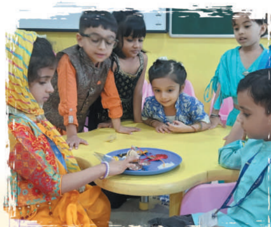
RAKSHA BANDHAN CELEBRATION