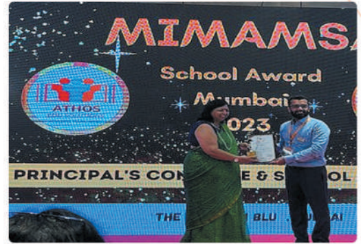
MIAMAMSA SCHOOL AWARD, 2023