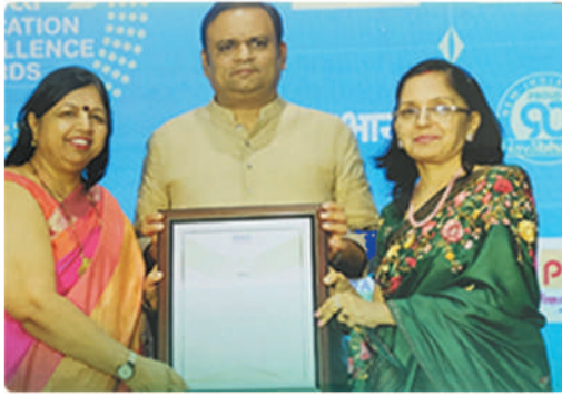
NAVABHARAT EDUCATION EXCELLENCE AWARDS, 2024