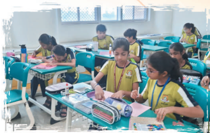
MAKING GREETING CARDS