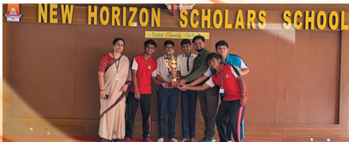
State Level Winner