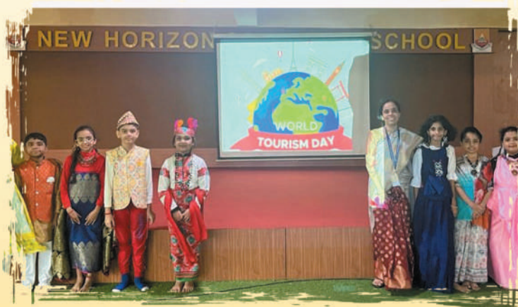
WORLD TOURISM DAY