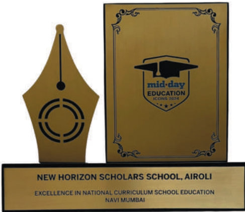
Excellence in National Curriculum School Education (Mid-day education icon)