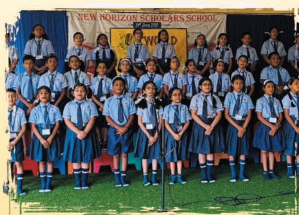
WORLD MUSIC DAY