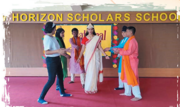
NATIONAL UNITY DAY