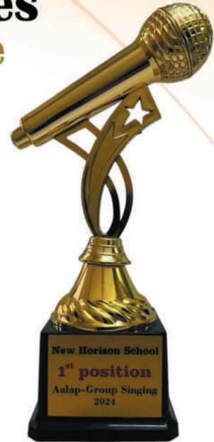
New Horizon Idol singing Interschool Competition 2024-25