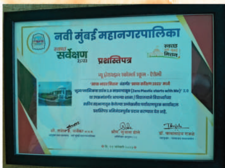
Awarded for using zero plastic under Swachh Navi Mumbai Mission 2023