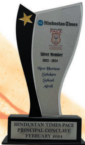
Hindustan Times Pace Principal Conclave