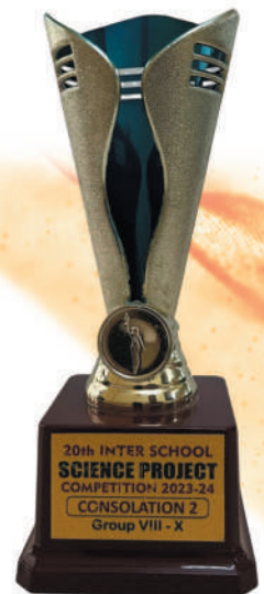
International Science Project Sri Maa Vidyalaya