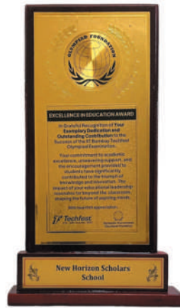
Excellence in Education IIT Bombay Techfest, Olympiad International Educational Foundation