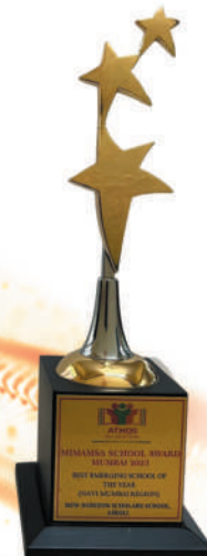
Mimamsa School Award Mimamsa by Athos Edusolutions