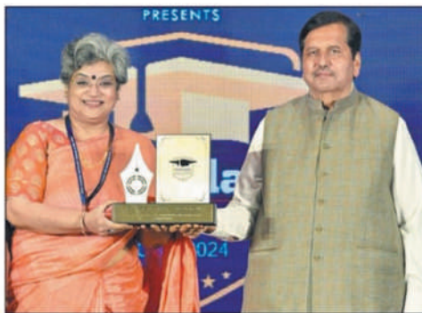
Excellence in National Curriculum School Education